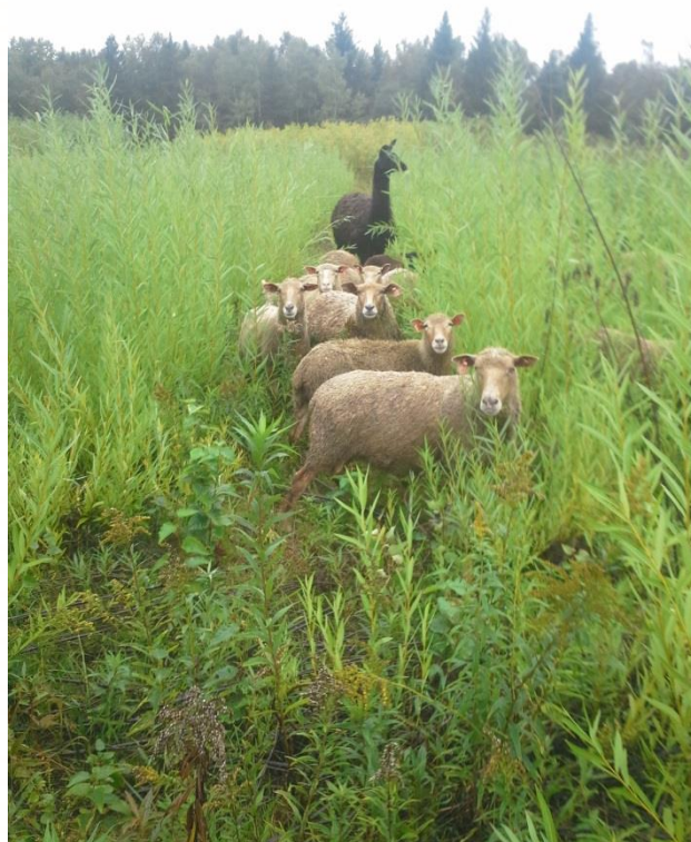
Figure 2. Sheep grazing coppiced regrowth

Some results changed when native Trembling Aspen was removed from the poplar group. When comparisons between willows and poplars were done using only domestic trees, willows had significantly higher levels of P, Mg, Ca, Mn, and Al. Poplars had significantly higher levels of Cu.